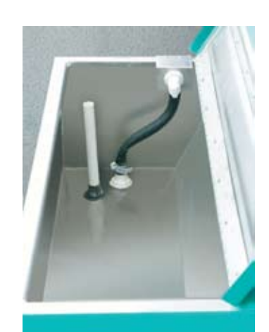
• Port side aerated livewell (DN 16SST)